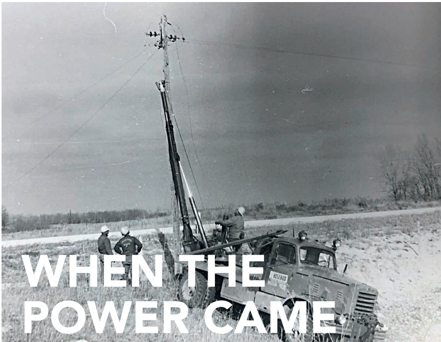
Rosebud Electric Cooperative providing power in the early days.